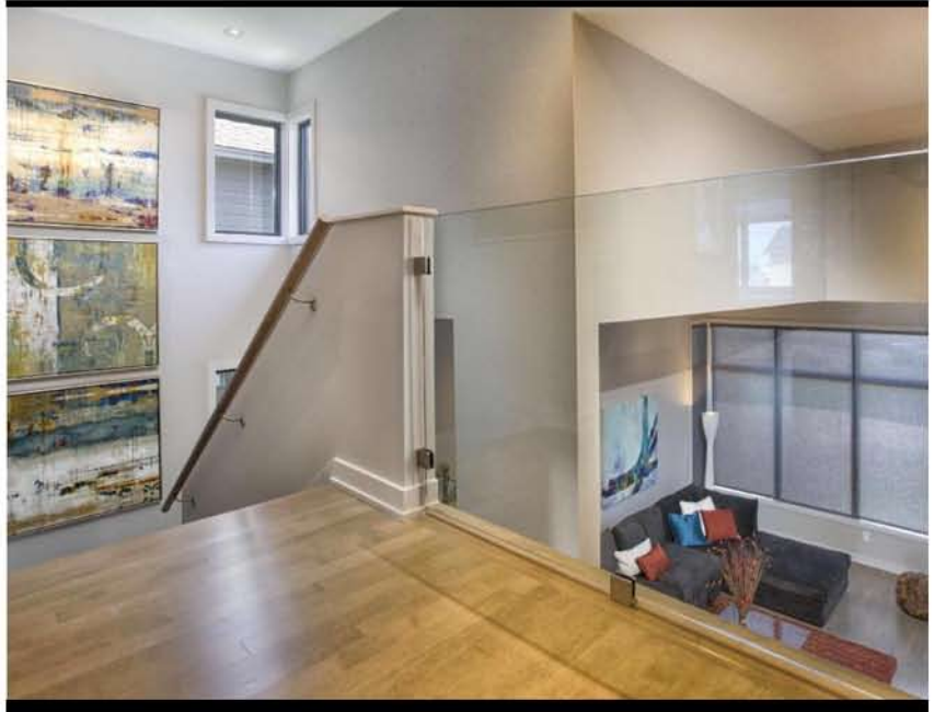
Tempered glass panels on the second-floor landing maintain the feeling of openness while maximizing the use of

Published on: June 13, 2014 | Last Updated: June 13, 2014 11:39 AM EDT